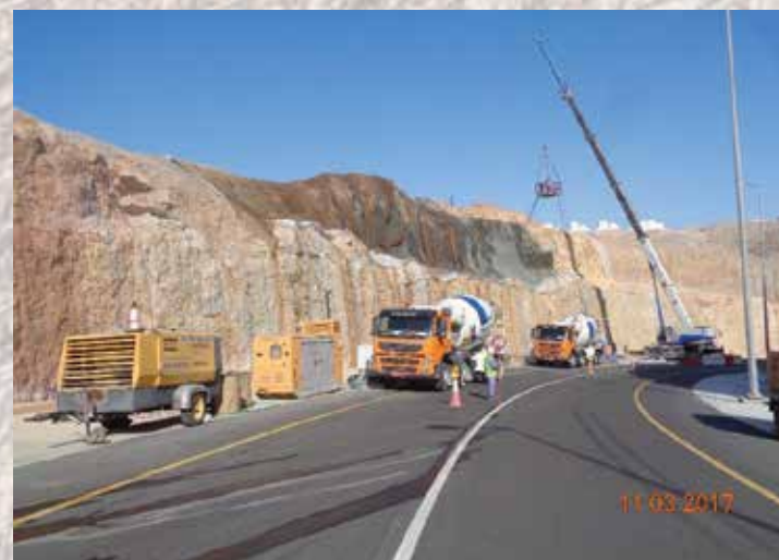
Spraying of Shotcrete by pumping machine