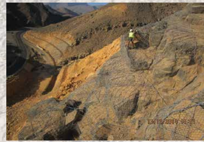
Installation of Cable Netting