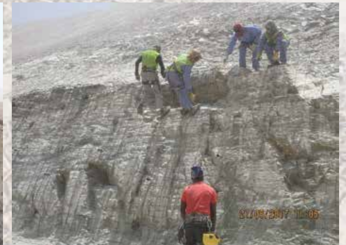
Welded mesh installation