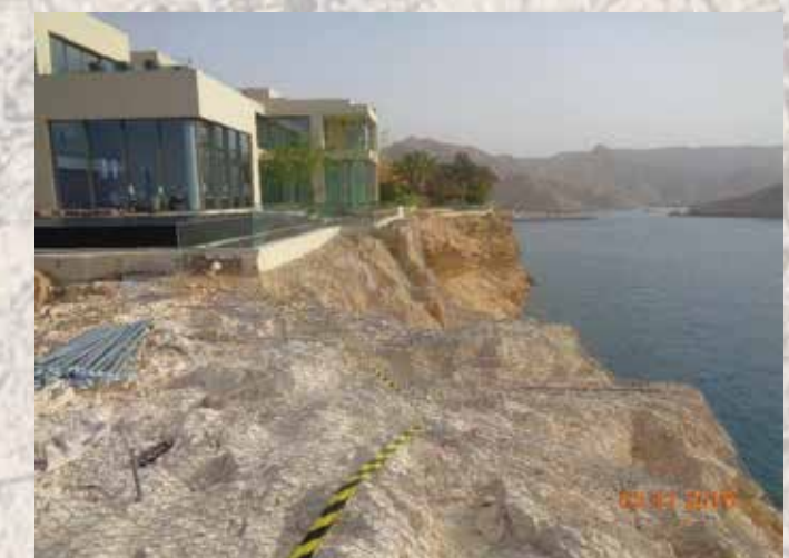
View from the top of the villa