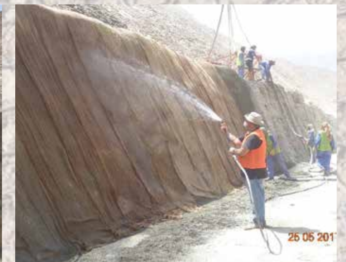
Curing of executed shotcrete