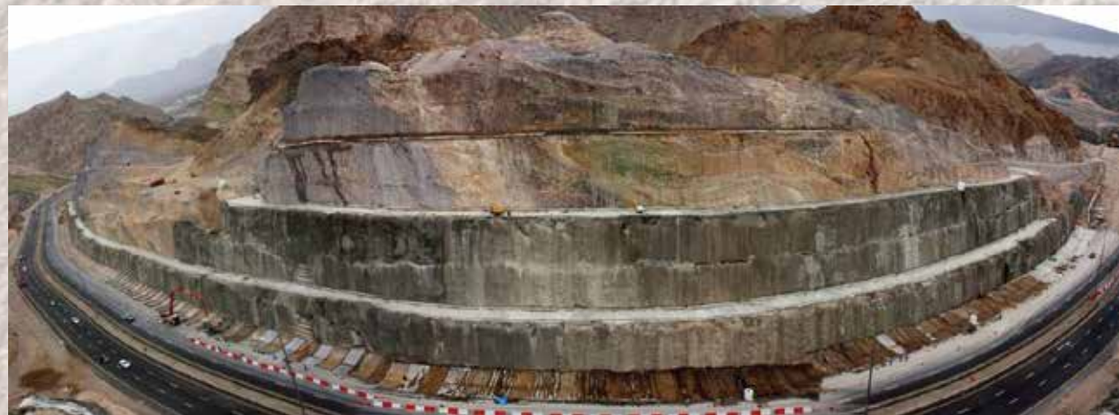
Wadi Adai Site km 1+700