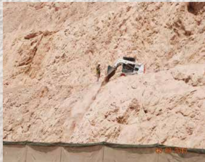
Cleaning berm by using bobcat

Project Slope protection works for Hay Al Turath – Ghubrat Nizwa Road August 2014 – August 2015 Client Sultanate of Oman Ministry of Transport & Communications Main Contractor TEICO OVERSEAS LLC Subject Slope protection and consolidation works Quantities 20,060 sq.m of Reinforced Wire Mesh 1,440 sq.m of Cable Netting 4,200 sq.m of RockFall barrier 30,067 sq.m of Shotcrete 2,076 lin.m of Rock Dowels 9,254 sq.m of Concrete lining 910 cu.m of Gabions 242,625 cu.m of Excavation - Light Cleaning & Scaling