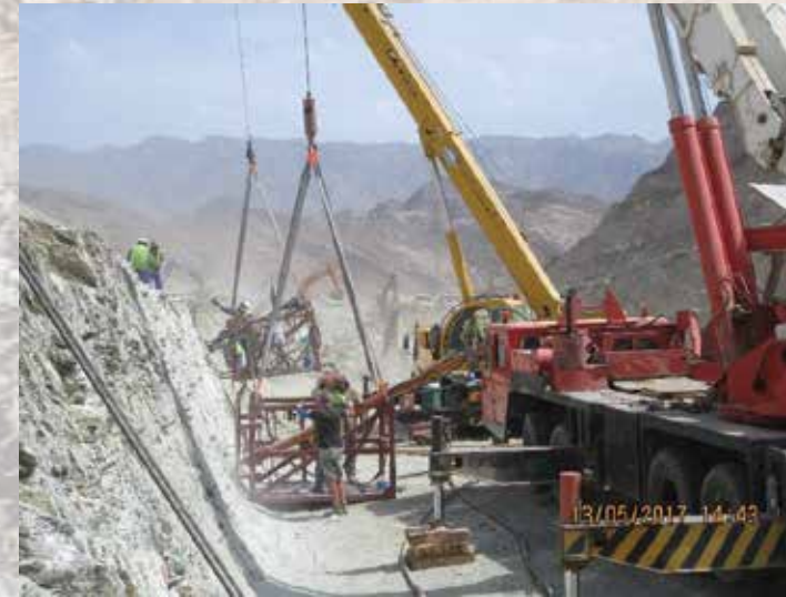
Drilling of rock dowels

Project Design & Construction of Yitti to Al Sifa Road Development and Al Sifa internal Roads May 2017 – In progress