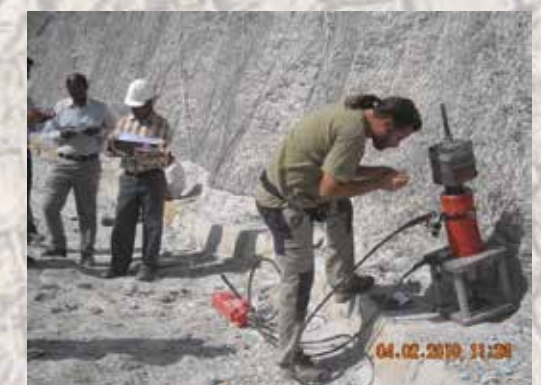
Pull out test