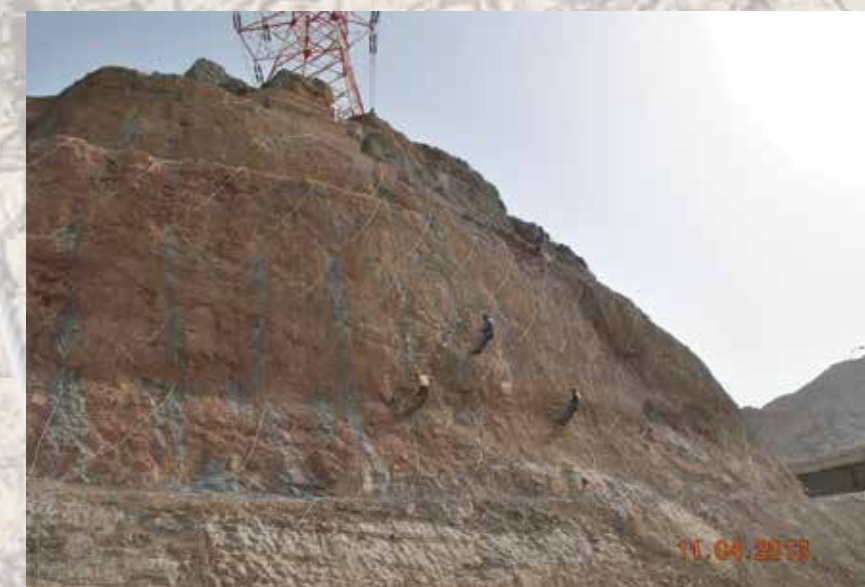
Installing of Reinforced Steel Cables