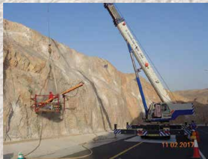
Drilling of rock dowels