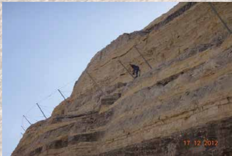
Installation of rock fall barrier

Project Construction of Hasik - Ash Shuwaymiyah Road April 2012 – October 2013 Client Sultanate of Oman Ministry of Transport & Communications Main Contractor Galfar Engineering & Contracting SAOG Subject Slope Protection Quantities 145,000 sqm of Reinforced Wire Mesh 50,000 sqm of Simple Wire Mesh 26,250 sqm of Rock Fall Barrier 500kJ 10,000 sqm of Rock Fall Barrier 1000kJ