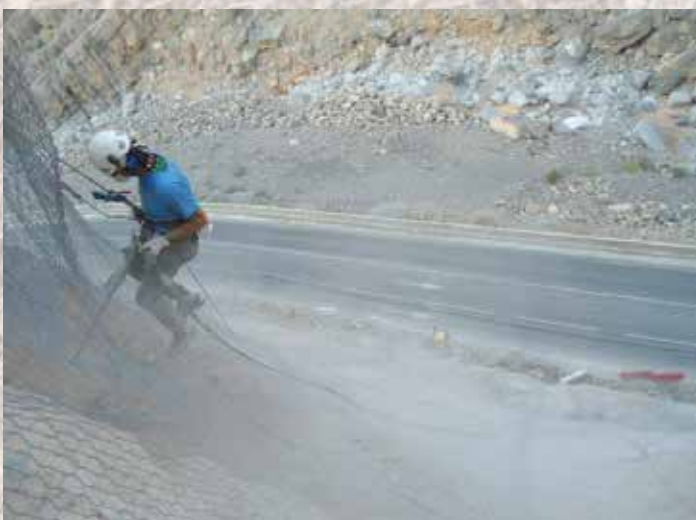
Manual drilling with specialized climbers