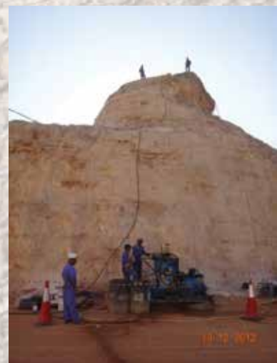
Grouting of reinforced wire mesh dowels