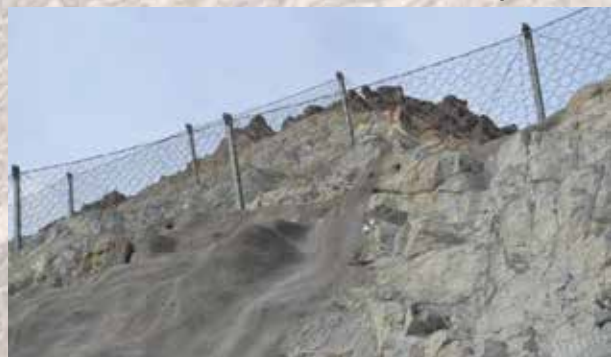
Rock Fall Barrier 2000 kJ