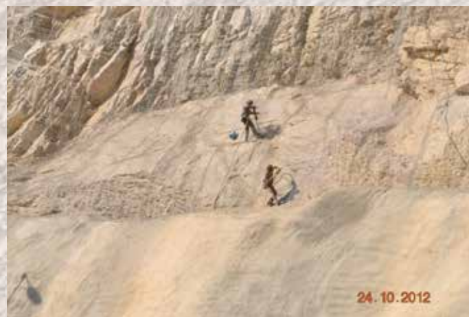
Manual drilling with specialized climbers