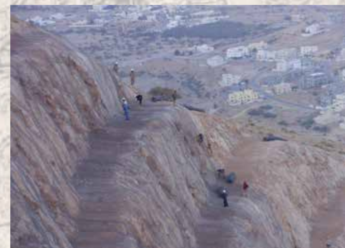
Installation of wire mesh