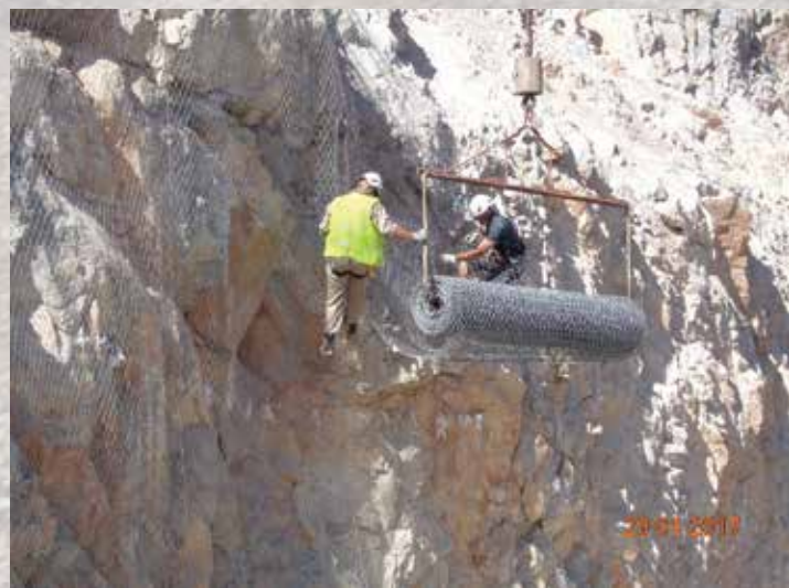
Placing of wire mesh roll