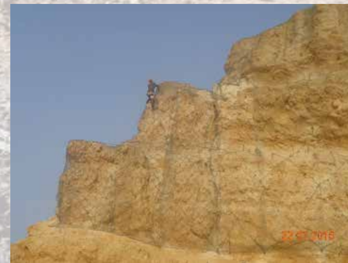
Installation of cable netting panels