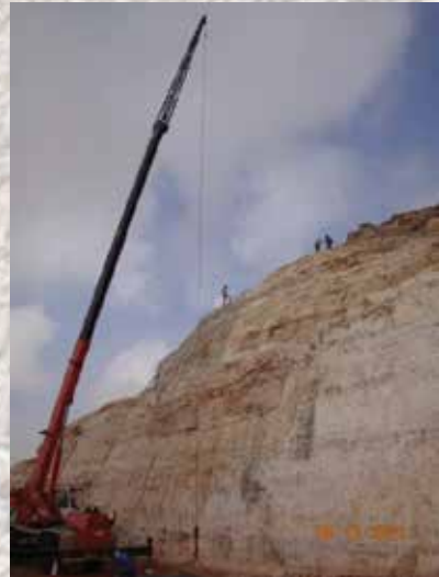
Placing of the mesh with crane