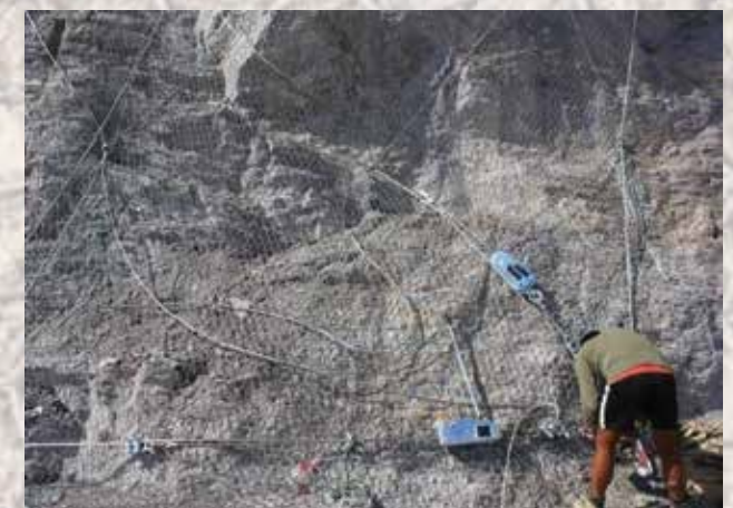
Tightening of steel cables