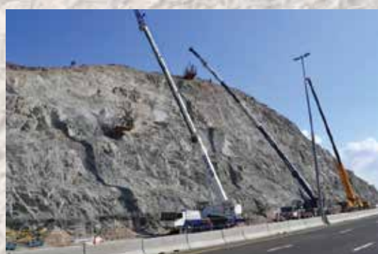
Drilling with rigs on basket