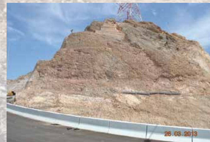
Placing of Wire Mesh Panels

Project Wadi Adai Interchange March 2013 – April 2013 Client Sultanate of Oman Muscat Municipality Main Contractor Federici Stirling Batco LLC Subject Slope Protection Quantities 10,000 sqm of Reinforced Mesh