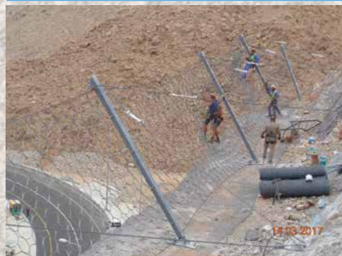
Rockfall barrier 1500 kJ installation