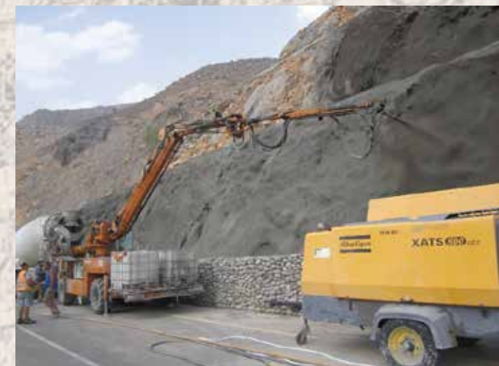
Spraying of Shotcrete by robotic machine