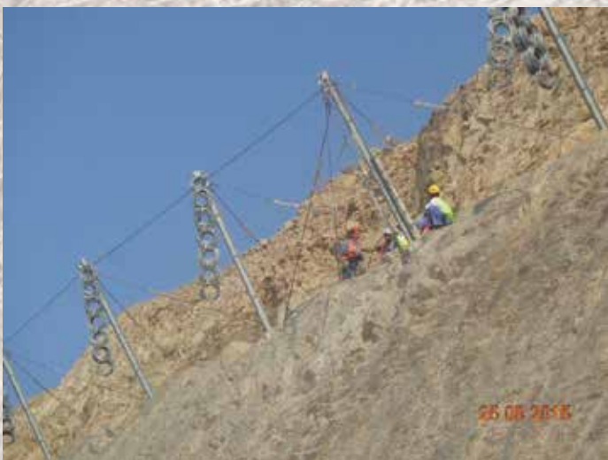
Installation of rockfall barrier