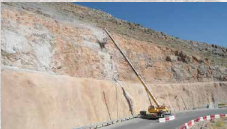
Drilling with basket

Project Upgration of Birkat Al Mouz - Sayq Road May 2011 – March 2012 Client Sultanate of Oman Ministry of Transport & Communications Main Contractor Galfar Engineering & Contracting SAOG Subject Slope Protection Quantities 61,000 sqm of Reinforced Mesh 2,600 m of Rock Dowels 2,500 m of Rock Anchors