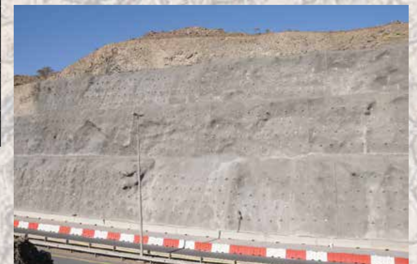
Final surface with rock anchors and shotcrete