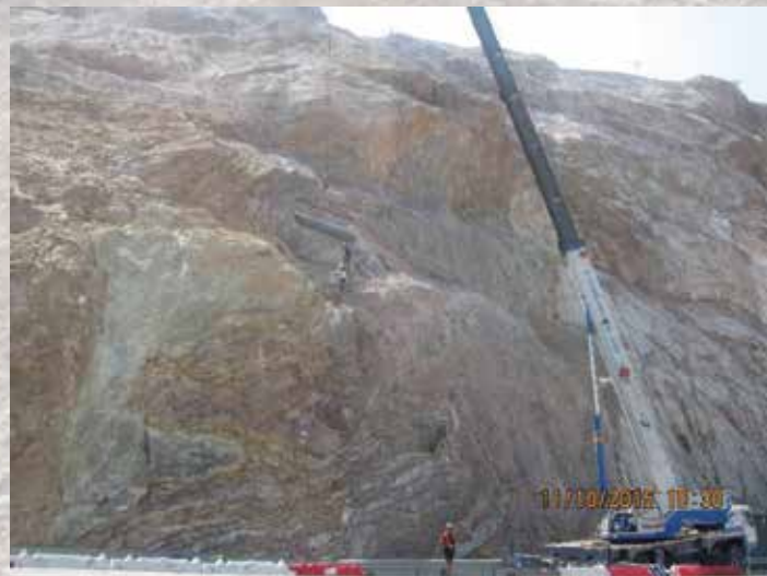
Installation of wire rolls by using crane

Project Construction of Slope Protection or Repair for Bausher – Al Amerat Road October 2014 – April 2016 Client Sultanate of Oman Muscat Municipality Main Contractor TEICO OVERSEAS LLC Subject Slope protection and consolidation works Quantities 113,356 sq.m of Slope Netting (Simple & 11,148 sq.m of Cable Netting Reinforced ) 19,110 sq.m of RockFall Barrier 198,937 cu.m of Light Cleaning & Scaling 3,585 lin.m of Rock Dowels & Anchors 447 lin.m of Jet-grouting