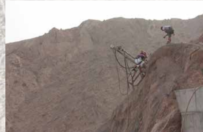
Drilling at high elevation

Project Dualisation of Bausher -Al Amerat Road (Phase 2) December 2011 – August 2012 Client Sultanate of Oman Muscat Municipality Main Contractor Galfar Engineering & Contracting SAOG Subject Slope Protection Quantities 33,000 sqm of Reinforced Mesh 2,500 m of Rock Dowels