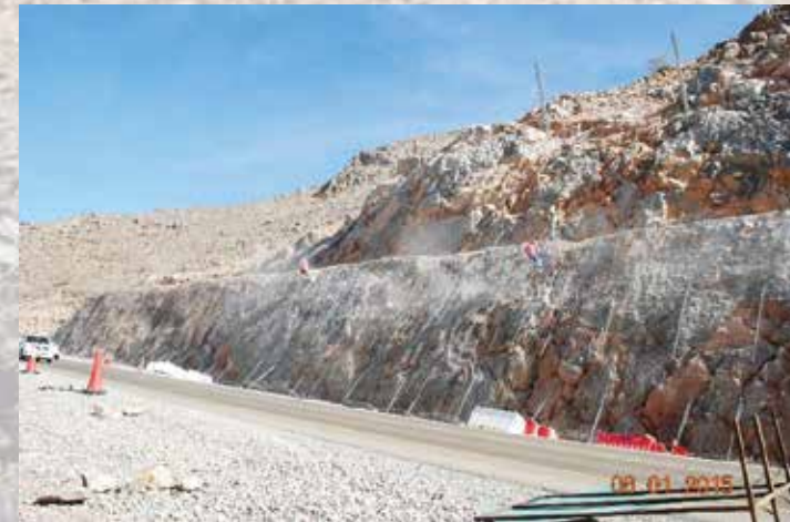
Drilling of reinforced wire mesh

Project Slope protection works for Hay Al Turath – Ghubrat Nizwa Road August 2014 – August 2015 Client Sultanate of Oman Ministry of Transport & Communications Main Contractor TEICO OVERSEAS LLC Subject Slope protection and consolidation works Quantities 20,060 sq.m of Reinforced Wire Mesh 1,440 sq.m of Cable Netting 4,200 sq.m of RockFall barrier 30,067 sq.m of Shotcrete 2,076 lin.m of Rock Dowels 9,254 sq.m of Concrete lining 910 cu.m of Gabions 242,625 cu.m of Excavation - Light Cleaning & Scaling