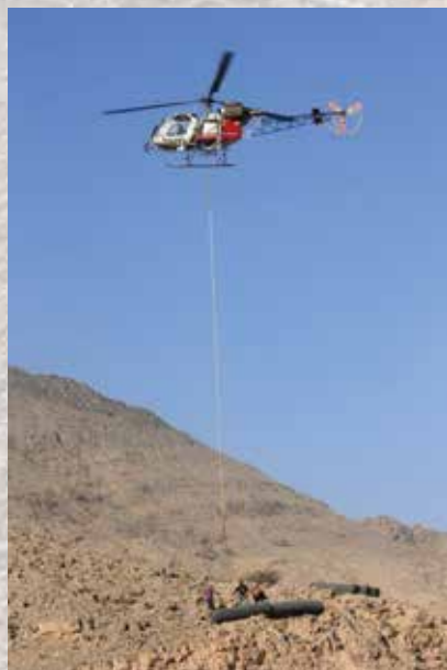
Placing of the mesh rolls by helicopter

Project Construction of Wadi Adai – Al Amerat Road (Phase2) September 2012 – August 2013 Client Sultanate of Oman Muscat Municipality Main Contractor Nagarjuna Construction Company International LLC Subject Slope Protection Quantities 80,000 sqm of mesh 320 sqm of Rock Fall Barrier 1000kj 750 sqm of Rock Fall Barrier 3000kj 210 sqm of Rock Fall Barrier 5000kj