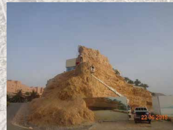
Installation of wire mesh by using manlift