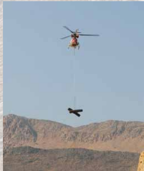
Placing of the mesh rolls by helicopter

Project Construction of Wadi Adai – Al Amerat Road (Phase1) April 2011 – January 2012 Client Sultanate of Oman Muscat Municipality Main Contractor Nagarjuna Construction Company International LLC Subject Slope protection and consolidation works Quantities 72,500 sqm of mesh 1,250 m of rock dowels/anchors