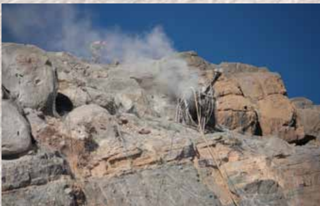
Drilling at high elevation with saddle and specialized climbers