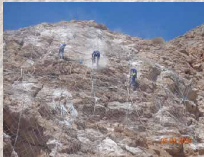
Drilling of cable netting panels