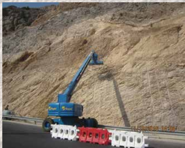
Installation of welded mesh for shotcrete