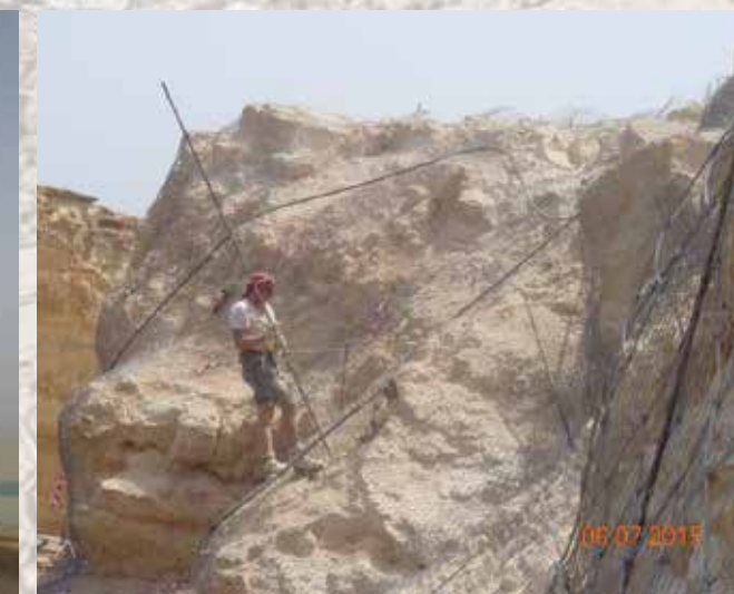
Drilling of rock dowels