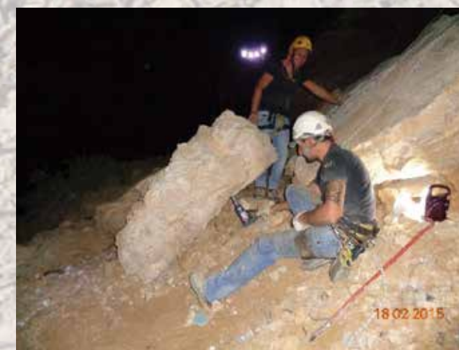
Scaling and removing boulders