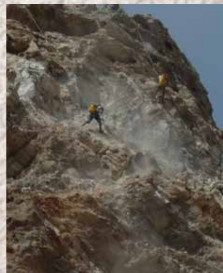
Removal of boulders

Project Dualisation of Bausher -Al Amerat Road (Phase 1) March 2011 – December 2012 Client Sultanate of Oman Muscat Municipality Main Contractor Galfar Engineering & Contracting SAOG Subject Slope protection Quantities 27,400 sqm of Mesh