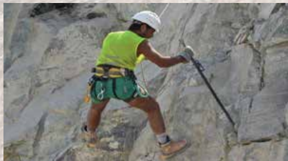
Scaling and removal boulder at high elevation with specialized climbers

Quantities 4,000 sqm of Reinforced Wire Mesh 12,000 sqm of Rock Fall Barrier