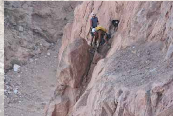
Removal boulders with hydraulic jack

Project Dualisation of Bausher -Al Amerat Road (Phase 2) December 2011 – August 2012 Client Sultanate of Oman Muscat Municipality Main Contractor Galfar Engineering & Contracting SAOG Subject Slope Protection Quantities 33,000 sqm of Reinforced Mesh 2,500 m of Rock Dowels