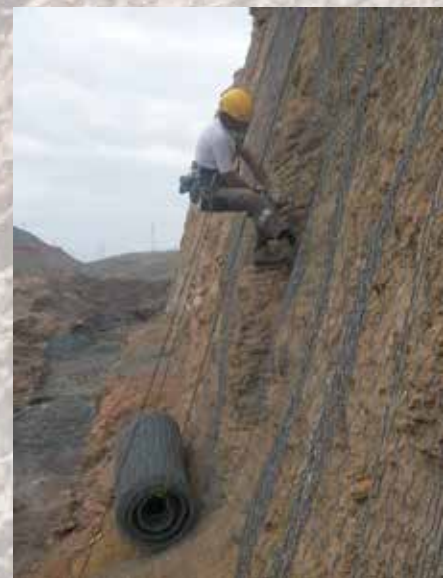
Installation of wire mesh