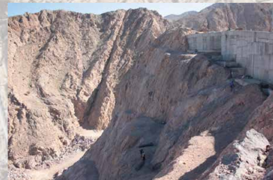
Placing of mesh