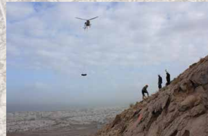
Transport of mesh rolls with helicopter