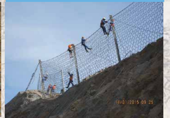
RockFall barrier 2000 kJ installation