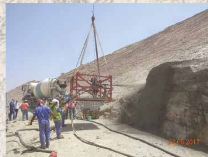
Spraying of Shotcrete by pumping machine