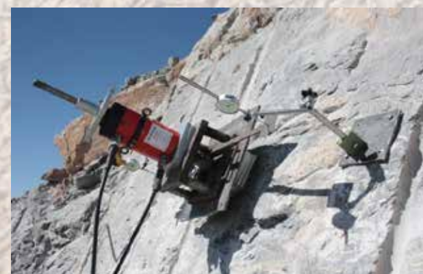
Pull out test