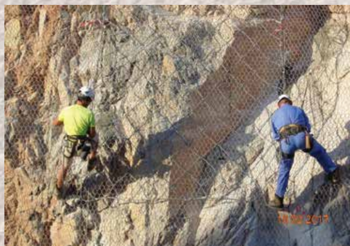
Installation of cable netting