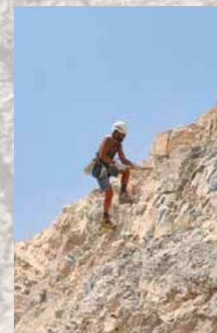
Scaling & Removal boulders