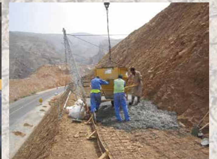
Waterproofing of berm by placing concrete