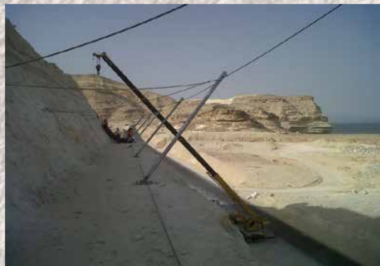
Rock fall barrier 1000 kJ