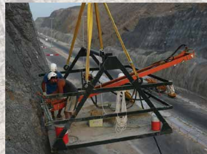
Drilling with rigs on basket