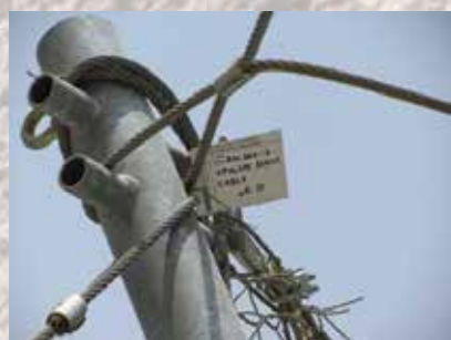
Rock Fall Barrier 1000 kJ