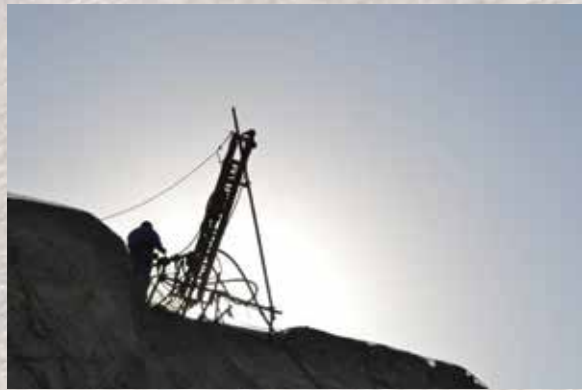
Drilling with saddle

Project Treatment, Protection & Rock Stabilization for Dubai / Fujairah Freeway December 2011 – June 2012