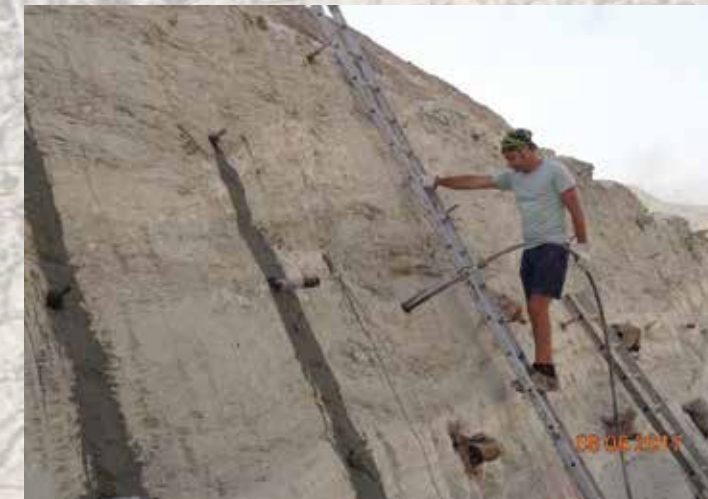
Grouting of rock dowels