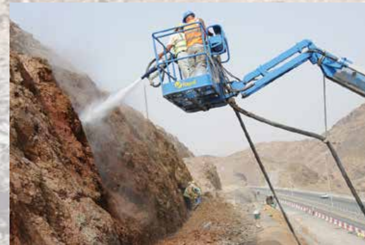
Cleaning & wetting of slope

Project Tawaian to Dibba Highway (UAE) December 2008 – December 2009