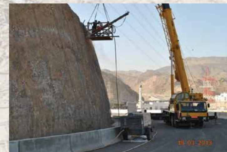
Drilling with basket