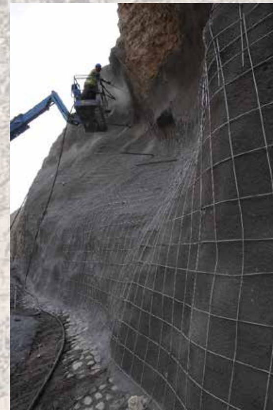
Installation of welded mesh

Quantities 5000 sqm fibers shotcrete 1000 sqm shotcrete w/welded mesh