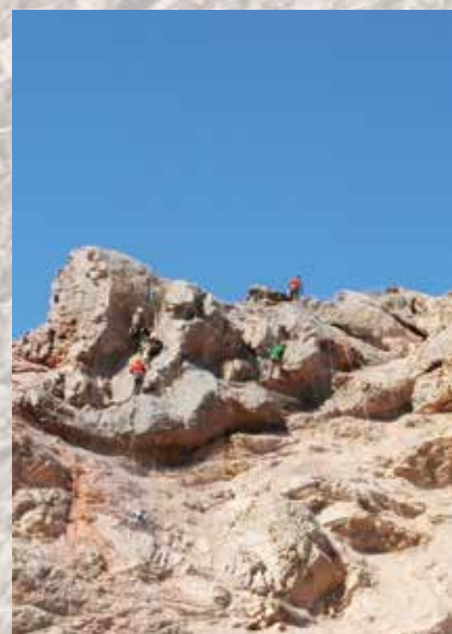
Installation of wire mesh